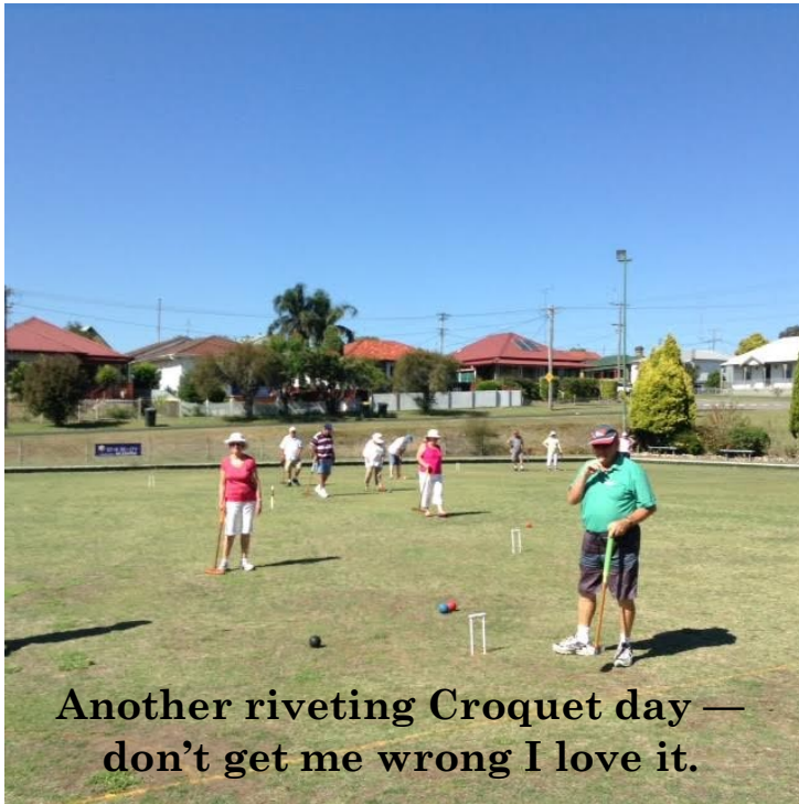
Another riveting Croquet day — don't get me wrong I love it.