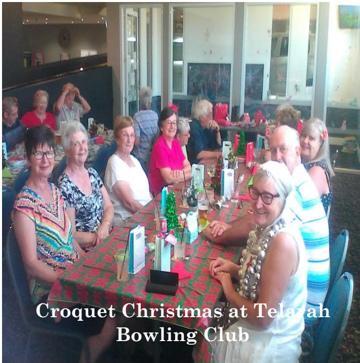
Croquet Christmas at Telarah Bowling Club